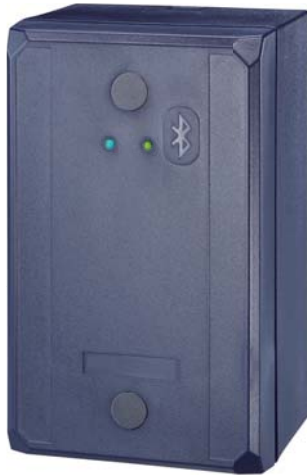
DG-120R ANSI Standard